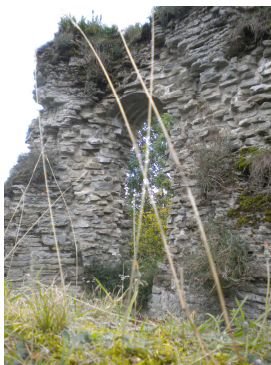
Wigmore Castle – Seat of the Mortimer Lords of the March

Member of a prestigious national history society; contact with officers, experts and other members; access to 'members' only areas of the society website; three copies a year of the newsletter, and a copy of the annual Journal; discounted rates for all conferences and field visits.